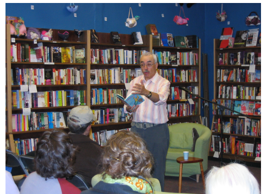
Juan Felipe Herrera in Madison in 2008.

Herrera was on the UW-Madison campus as the Arts Institute's Interdisciplinary Artist in Residence for about a week in April 2008. During his residency, he was very active on campus and in the greater Madison community. There were three events open to the public, including where he read and performed from his book 187 Reasons Mexicanos Can't Cross the Border . He spoke to seven classes on campus and spent an intensive amount of time with first and second grade students at Lowell Elementary School creating a performance with the students based on his children's book Super Cilantro Girl/La Superniña del Cilantro .