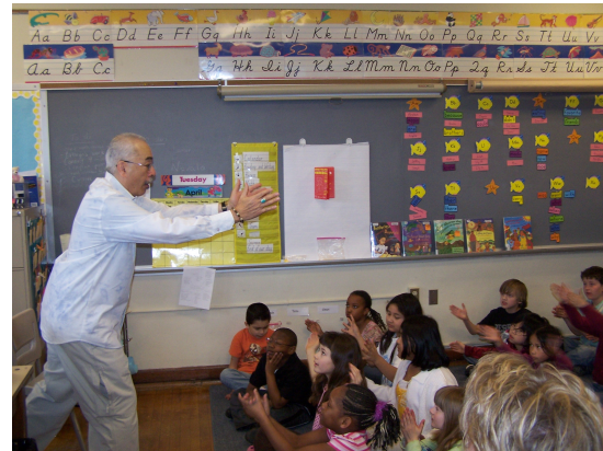
Juan Felipe Herrera at Lowell Elementary School in Madison in 2008.

"His visit was phenomenally successful. The students absolutely loved him—several called it the highlight of their academic year or even their four years at UW-Madison. He connected with the students in a fantastic way. For my literature class, he also had a spoken word workshop, and I was amazed at what he was able to pull out of the students. Not only did they produce great spoken word pieces (and get a new found interest in the genre), they also incorporated spoken word into subsequent student presentations."