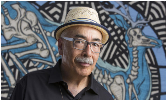
Juan Felipe Herrera.

On June 10, 2015, the Library of Congress announced Juan Felipe Herrera as their 21 st Poet Laureate for one year starting in September 2015. This is one of the highest levels of recognition for a poet and Herrera is the first Latino poet bestowed this distinction. He also served as California's Poet Laureate from 2012-2014.